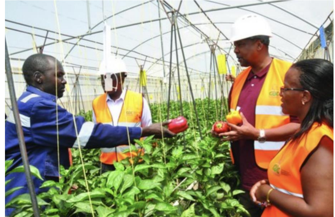
Direct Use Geothermal Pilot Project at Menengai, Kenya