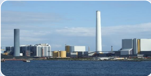
Kalundborg Industrial Park Sweden

Designed around a 1,500 MW coal-fired plant Provided a blueprint of an industrial symbiosis network for neighbouring companies