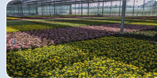
GEOFOOD Project Netherlands

Combined geothermal heat and power plant opened operations including Blue Lagoon spa and a dermatology clinic