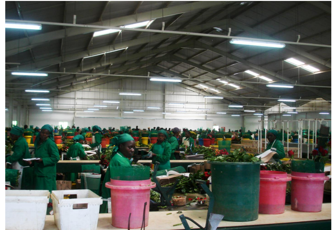
Oserian flower farm at Olkaria, Kenya