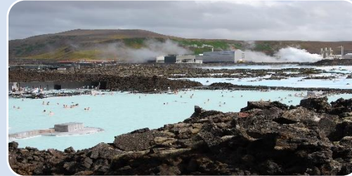
Svartsengi Resource Park Reykjanes peninsula, Iceland

Designed around a 1,500 MW coal-fired plant Provided a blueprint of an industrial symbiosis network for neighbouring companies