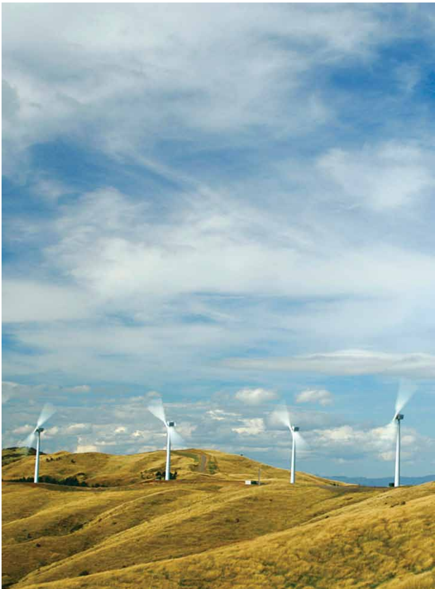
Te Rere Hau wind farm, Manawatu, New Zealand