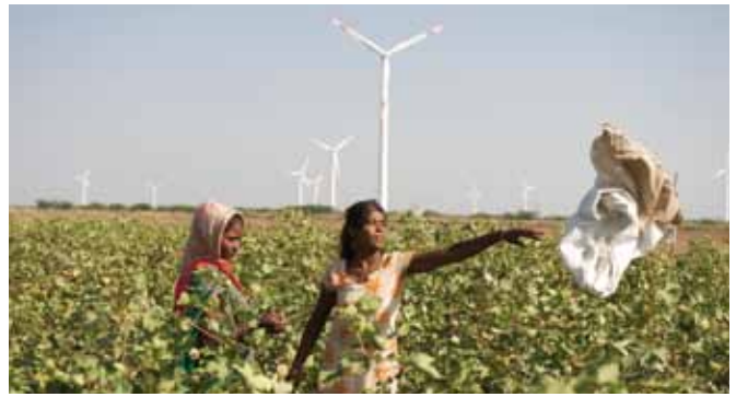
Kutch, Gujarat, India

The government set a target for renewable energy to contribute 10% of total power generation capacity by 2012. By August 2011 that target had already been exceeded and today India's energy mix includes 11.5% of renewable energy capacity. This achievement is largely due to wind energy installations.