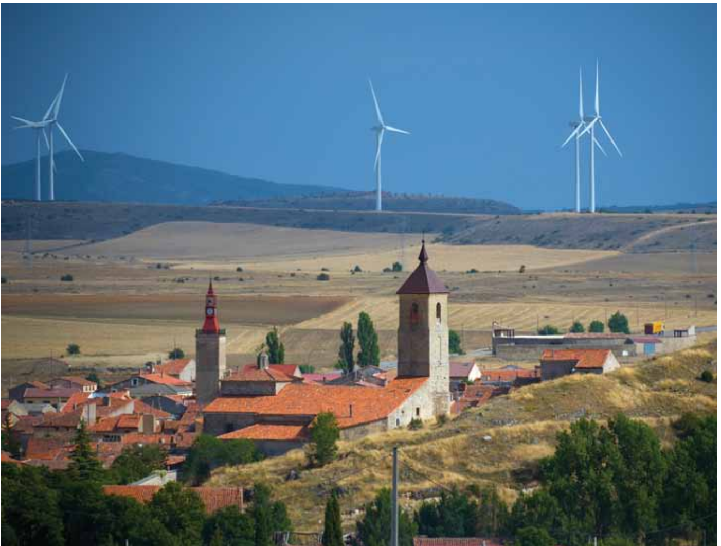
Maranchón, Guadalajara, Spain

Spain's initial success has been possible due to the existence of a strong policy regime at a time when very few similar initiatives existed. A solid industrial sector was created, and the Spanish manufacturers developed strong export capacity. However since 2010, the wind sector has almost come to a standstill and its future beyond 2012 remains unclear.