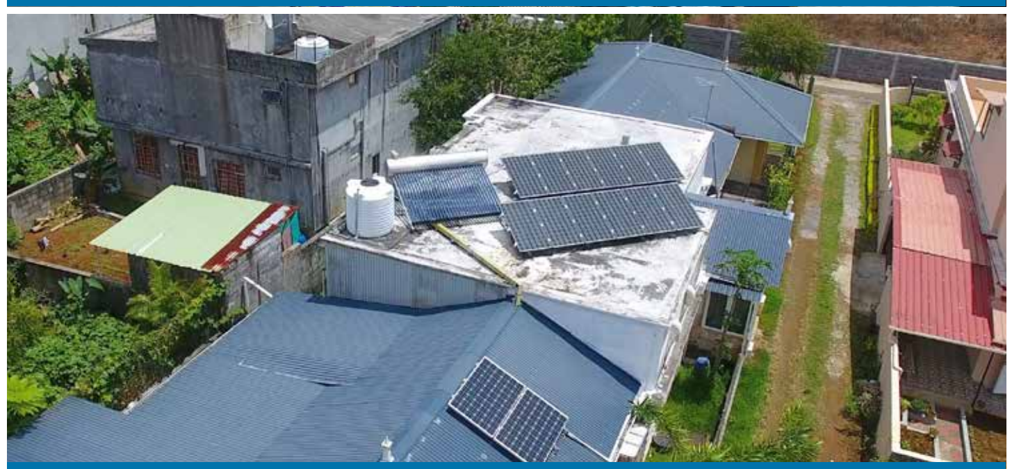
A solar PV rooftop project in Mauritius will make electricity affordable for over 30,000 people in low-income communities.