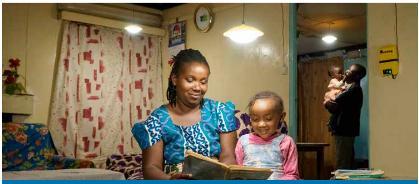
Solar home systems in Rwanda will provide 500,000 families with sustainable, affordable electricity.