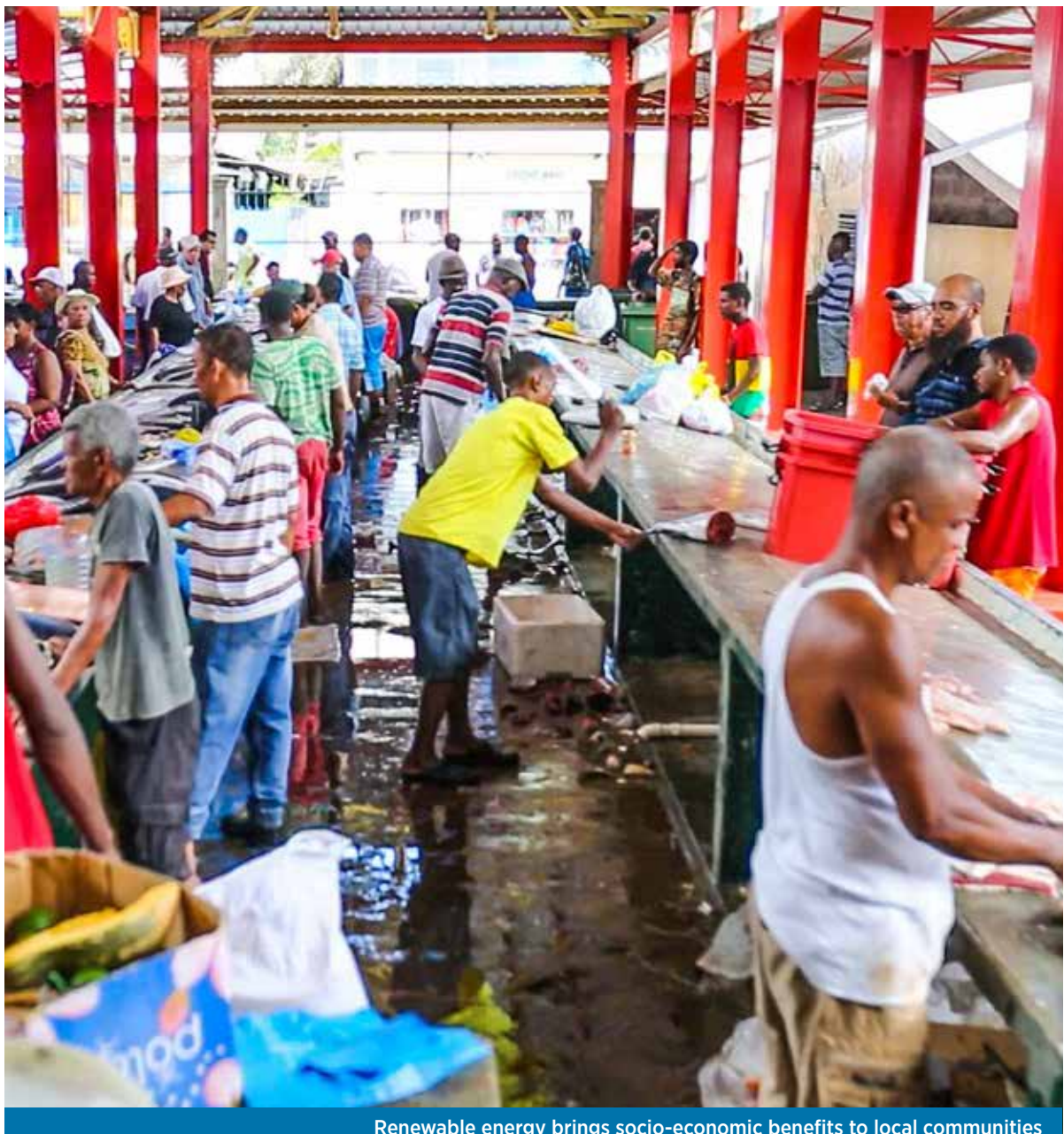
Renewable energy brings socio-economic benefits to local communities

As a Co-funding Entity: ADFD loans cover up to half of a project's total cost, so the remaining finance must be leveraged from other sources. Upon request, IRENA will share details of shortlisted projects with government development agencies and donors as well as bilateral, multilateral and global funds that are interested in co-funding projects processed through the Facility.